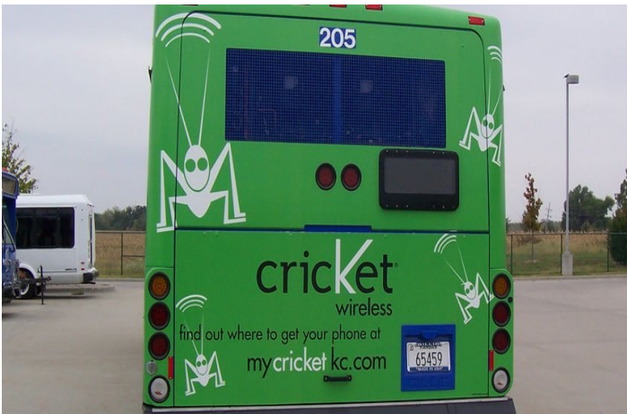
Full Tail Bus Wrap: $400/Month