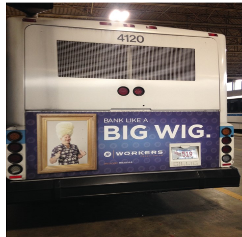
Super Tail Bus Wrap: $200/Month

Bus wrap installation is the responsibility of the sign-creation company, by appointment only. ANY product covering windows must be made of semi-transparent window wrap material. Bus sizes and styles differ, and exact measurements are the responsibility of the production/installation company.